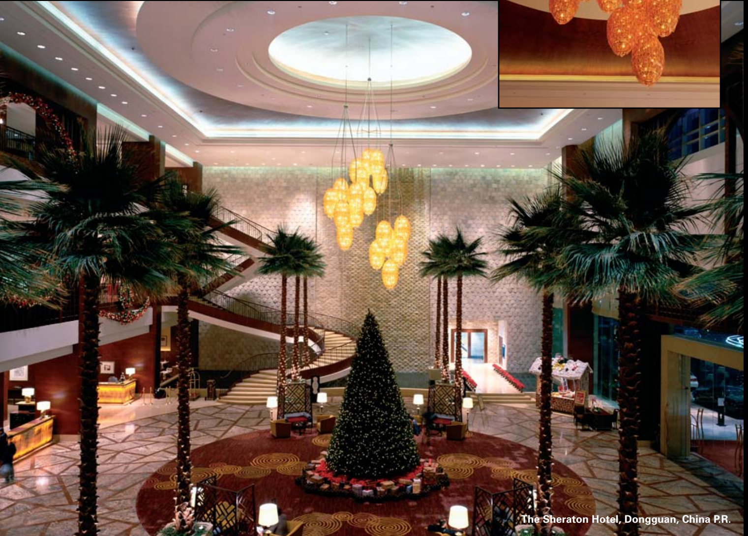
The Sheraton Hotel, Dongguan, China P.R.